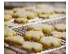
Mmmm, Sugar Cookies indeed!

3.Bake 8 to 10 minutes in the preheated oven, or until golden. Let stand on cookie sheet two minutes before removing to cool on wire racks.