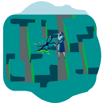
God’s pathway for you may look like a maze but follow where God leads you.

God has called every one of us to different ministries. Yes, our amazing God called us by name and assigned our various tasks, but will use us at the appointed time. Many times God has commissioned us and we find every excuse with his timing. I am too young, I am too old, I am not skillful, I not smart enough, I don’t have enough money, no one will support me and the list goes on and on. You may be wondering, if God is able to use me for what he has predestined, why would he allow me to be fearful of following the path he has chosen for me, why would he allow all of these fears and doubts to assail me, even though it’s something that I have always wanted? Faith is the substance of things hoped for and the evidence of things not seen. God intends for us to trust him, to totally rely on him. We of our own selves do not know our limitations but God knows what we can and cannot do. So, in order for us to reach our full potential, we have to trust God when we cannot see ahead, we have to rely on him and no one else, we have to believe that if he has called us for a ministry that he has already equipped us. So, when we receive our assignment, we need to step into the path God predestined for us banishing fear, doubt and insecurity from our minds. We should never doubt our abilities, for the same God who began a good thing in us will complete it.