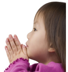
Thank you Lord!

Lord, I am thankful for all the many blessings of this life. Sometimes I may forget to say thank you, but bring it to remembrance, so that I could show you my gratitude. Amen