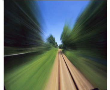
God’s train is in motion, get on board or get left behind.

Who knows this better than I do? I recalled when I gave my life to Christ, I said to my mother, “Mommy, I feel so bad that God is getting the worst of me,” and she said, “God is not getting the worst of you, he has the best in store for you.” When God takes control of your life, your limits are endless, you no longer lust after the things that cannot satisfy you or feel unworthy of God’s blessings. I am proud to say, I have been there and I have done that. Now that God is in control of my life, I am drinking from the wellspring of my father in heaven, and my joy is unspeakable. When I thought that there was nothing good left in me, nothing that God would want to use, he started to use me for his glory. Each time I am elevated to the next level, I barely get time to breathe before my next assignment begins, for God has started his train in motion, which is unstoppable, and I am on board. So, never think that God is getting what’s left of you, for he is the potter and he could make all things new, we are all work in progress, and when he sets our train in motion, nothing or no one could preempt it or stop it. When God is using us for his purpose he will remove every stumbling block and make every crooked way straight. He brings it to pass.