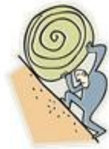
God will take your load when you wait patiently on him.