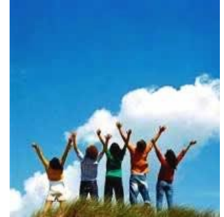
Learn to praise the Lord in the midst of your struggles.

Has there ever been a time in your life when you were going through something real bad, and you find yourself praising God? Yes! In the multitude of your anxieties, his comfort delights your soul. For others, when problems assail them, the last thing they want to do is to give God praise; instead they curse and complain, they question God, they doubt that he is able to see them through, and therefore find no delight in his comforts. I will encourage you to try praising God in the midst of your smallest anxiety, begin meditating on his word, sing hymns of praise, just talk to God, and he will give you the peace that surpasses all understanding. Your mind will become clearer so that you could handle your situation, your step will be more sure as you will walk with confidence, and you will be able to say when it is past, "If it had not been for the Lord on my side, tell me, where would I be?" Thank you Lord, for in the multitude of my anxieties, your comfort delights my soul. Thank you, that when my troubles seems overwhelming that you will be my comforter, that you will quiet the disquietness within me, and bless me with inner peace.