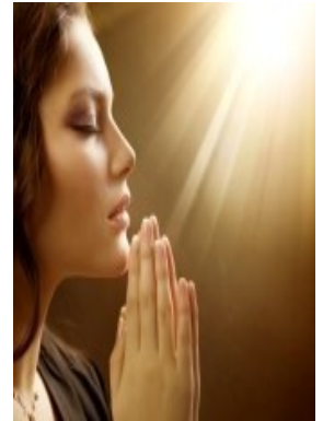
How will you begin and end each day?

If you know for sure that tomorrow will be your last day on this earth, how would you spend it? But, we do not know, and therefore, every day when we awake, we should shout it out, "This is the day that the Lord has made, I will rejoice and be glad in it." But, if your heart is heavy at the start of every day, if your mind is set on how many barns you need to fill, if your path is blocked with debris, if you worry about tomorrow which is not promised to you, there is no way you could rejoice and be glad in each new day. If you go to bed worrying about all that you have to take care of tomorrow, the problems you were not able to solve yesterday; remind yourself that today has its own share of troubles and tomorrow will have its own, for sufficient for today is its own trouble. Pledge that you will not allow your yesterday to take up more than your share of today. Give the troubles of yesterday to God and ask him for guidance to go through tomorrow. Make it your aim to begin every day with rejoicing, to go through every day expecting, and to end every day thankful, and you will begin to experience true happiness. The choice is yours, you could begin your day with worry and end it weary, or you could begin your day with prayer and end it with praise.